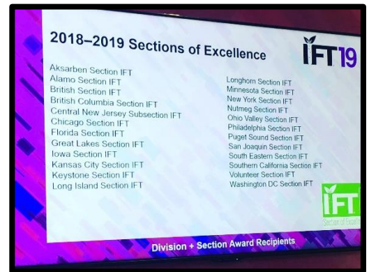
The Hall of Honor at IFT 19 recognized the Volunteer Section as a 2018-2019 Section of Excellence

Want to network with thousands of food science professionals? Want to be a part of the IFT Volunteer Section? Meet other students in food science? Gain exclusive access to internship opportunities, scholarships, and free professional development events? Sign up to be an IFT member! Just go to IFT.org and click on “ Become a Member ”. From there, follow the on-screen instructions. Students get discounted dues and becoming an annual member is only $60! Just graduated? There is an “ Early Career ” option that is discounted too!